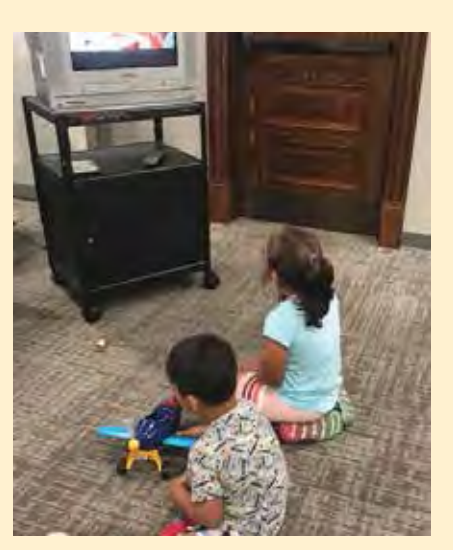
As their parents learned, these young children enjoyed crafts and games.